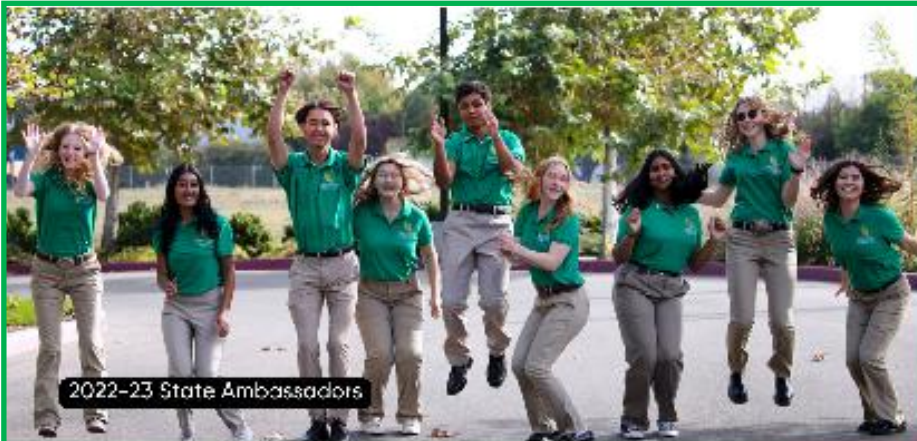
2022-23 State Ambassadors