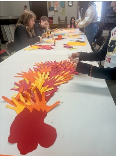
Paper Dragon design