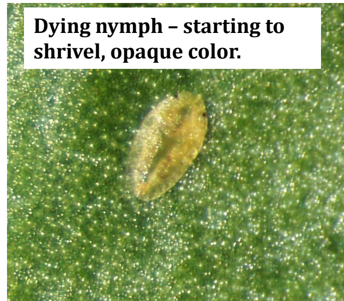
Dying nymph - starting to shrivel, opaque color.