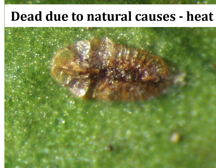
Dead due to natural causes - heat