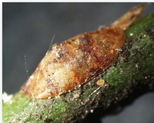
Figure 1. Dead female on a twig