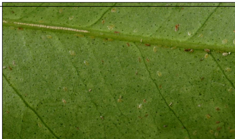
Figure 2. First instars on lower side of leaf