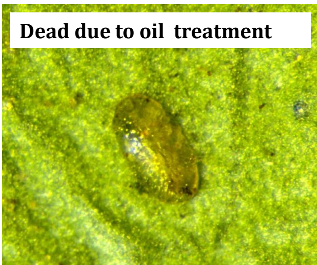
Dead due to oil treatment