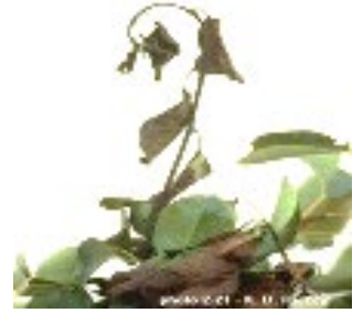
Figure 1 Fire blight