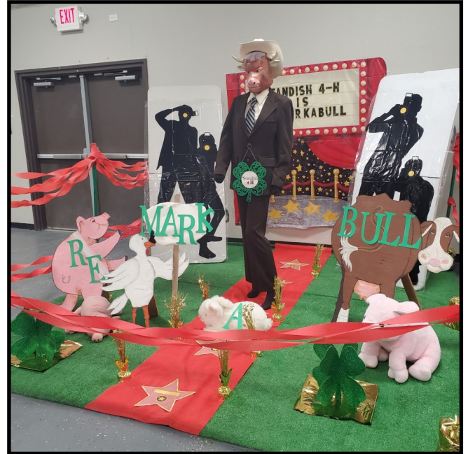
2nd place-$50 Standish 4-H