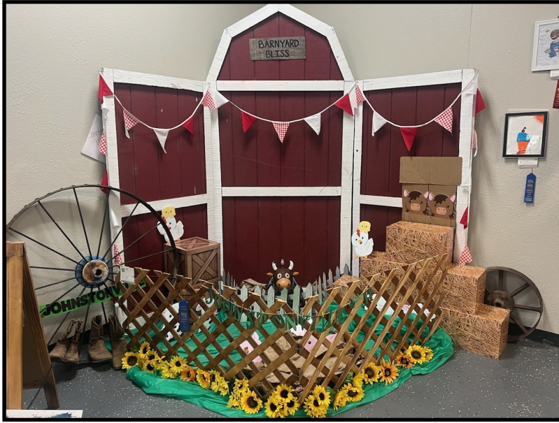
1st place—$100 Johnstonsville 4-H

“Barnyard Bliss with a Remarkabull Twist”