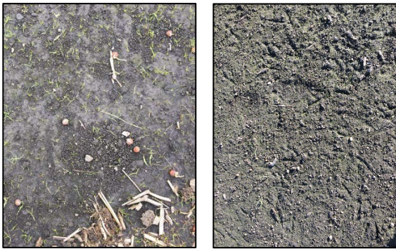
Figure 1. Large seeded varieties were not well incorporated into the soil. Bird pressure was heavy.

The 2022-2023 winter season presented a number of challenges for cover cropping at all three locations, and data collection was limited. Seasonal rainfall started early in the fall, which challenged cover crop establishment. At the Delta location, cover crop seed was flown onto the field on November 30 th , and the field was immediately harrowed. Despite harrowing, large seeded species were not well incorporated, and bird predation was severe (Fig. 1). Additionally, in the ten days after planting, the site received nearly 3.5 inches of rain and seasonal rainfall exceeded 25 inches.