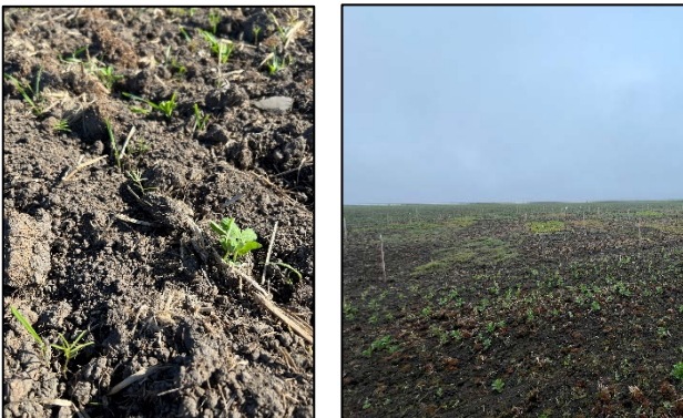
Figure 2. Successful stand establishment with drill-seeding and with drier fall conditions.

The 2023-2024 winter season started off fairly dry. The cover crop was drill-seeded on November 13 th , and all four species of the mix germinated (Fig. 2).