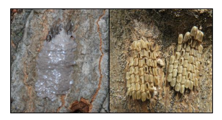
Figure 3. SLF eggs covered with waxy deposits (left) seed-like eggs with holes where SLF nymphs have emerged (right).

In Pennsylvania, the spotted lanternfly has one generation per year. Nymphs emerge between May and June and go through four immature stages. Adults start to emerge by late July. SLF overwinter as eggs which are laid between September to November on smooth tree surfaces and inanimate objects such as telephone poles, stones, pallets, outdoor equipment, firewood, railway cars, vehicles, etc. SLF's behavior of laying eggs on non-plant items contributes to their wide dispersal ability and likelihood of unintentional introduction into new areas.