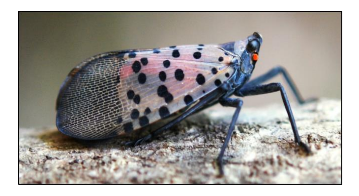
Figure 1. Side view of the adult Spotted Lanternfly (SLF).

Invasive species have the potential to cause high levels of economic damage when introduced into new environments that lack the predators that normally suppress their population in their native environments. International and national travel and commerce are ideal avenues for the introduction of exotic pests into the United States and California. Therefore, the identification and early detection of exotic pests are key to preventing their establishment in California. Everyone, including growers, PCA's, field workers, and home gardeners, can play an important role in keeping exotic pests out of your county by being the eyes and ears needed for early detection of the next exotic pest.