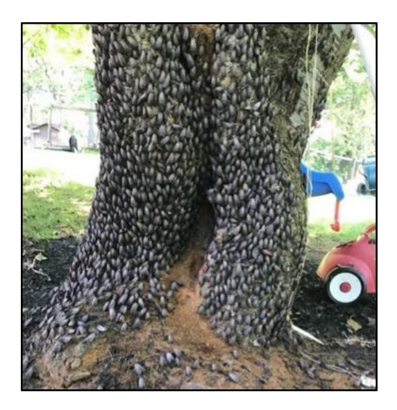
Figure 2. Aggregation of adult SLF in urban areas.

an agricultural pest, SLF may also be a nuisance pest in urban areas due to their aggregation behavior (Figure 2).