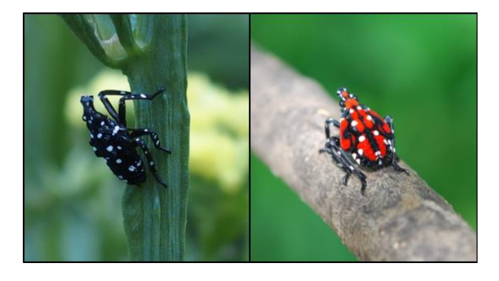
Figure 4. The first three immature stages are black with white spots (left) the fourth immature stage is red and black with white spots (right).

Each female produces one to two egg masses of 30 to 50 eggs each. Seed-like eggs are laid in multiple successive rows and covered with a yellowish-brown waxy deposit (Figure 3). The first three immature stages are black with white spots and lack wings. The fourth immature stage is red and black with white spots and possess small wing pads (Figure 4).