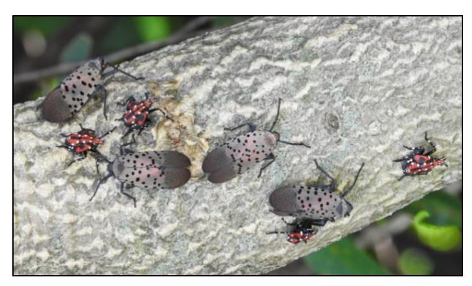
Figure 6. The fourth immature stage and adults of SLF.

The spotted lanternfly has the ability to negatively impact high value commodity crops in