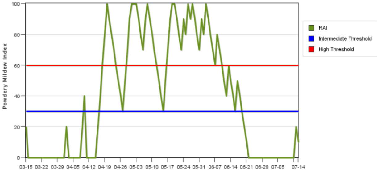
Figure 2. Risk Assessment Index (RAI) for grape powdery mildew from March 15 to July 14, 2024. The red line represents the threshold for high disease pressure (RAI > 60), while the blue line indicates low to moderate disease pressure (RAI > 30). Data were sourced from the UC IPM website, highlighting seasonal variations in disease risk.