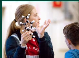
North Bay Science Discovery Day – March 8, 2025

We welcome submissions from all members of the community and encourage you to share your events, stories, or announcements. By contributing, you help us create a vibrant and informative newsletter that benefits everyone. Please ensure your submission is relevant, positive, and aligns with our community values. We look forward to hearing from you and sharing your news with the wider Marin County 4-H community!